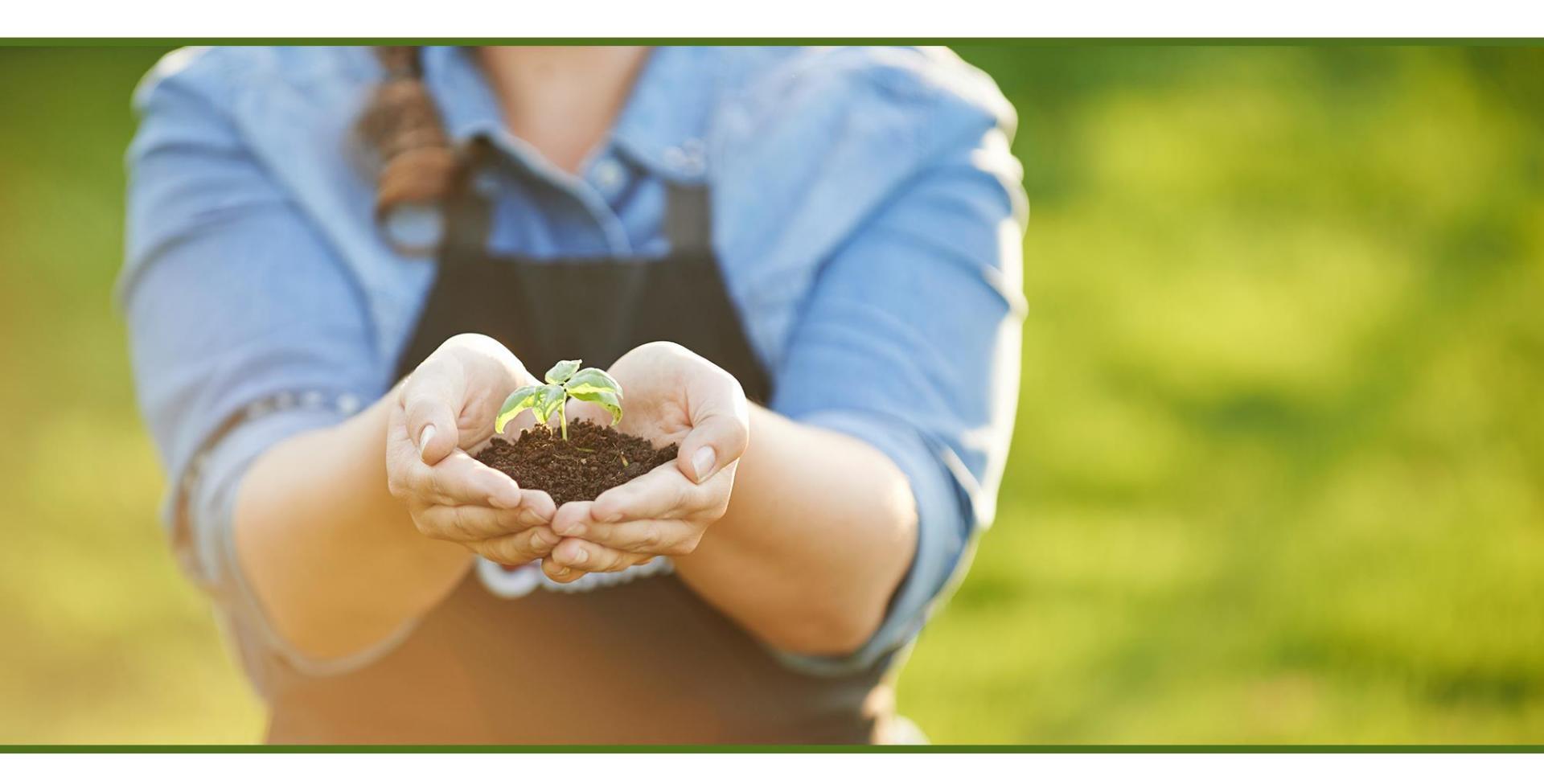
Presentation of the Hungarian Chamber of Agriculture